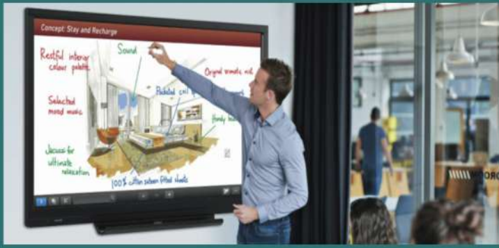
Projector Based Whiteboard